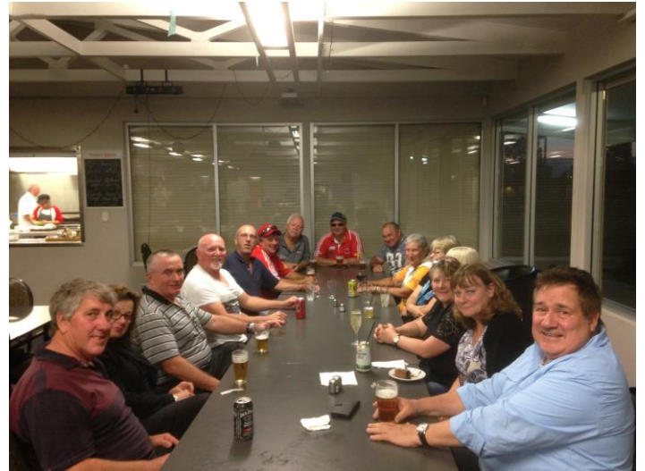
Great to have some of the past legends back at the club.

Here it is folks, the $1,000 draw is back again for another year on Sunday the 28 th of February. This is a staple event in the Woodville South Cricket Club social calendar, where a great time is had by all. Here's how it works. For only $50 you get a three hour package between 1-4pm that includes free Keg Beer, Wine, Champagne, Soft Drinks and Lunch. Raffles will also be run throughout the day with excellent prizes. Plus most importantly of all, by purchasing a ticket you go into the draw for a chance to win $1000! Don't miss out.