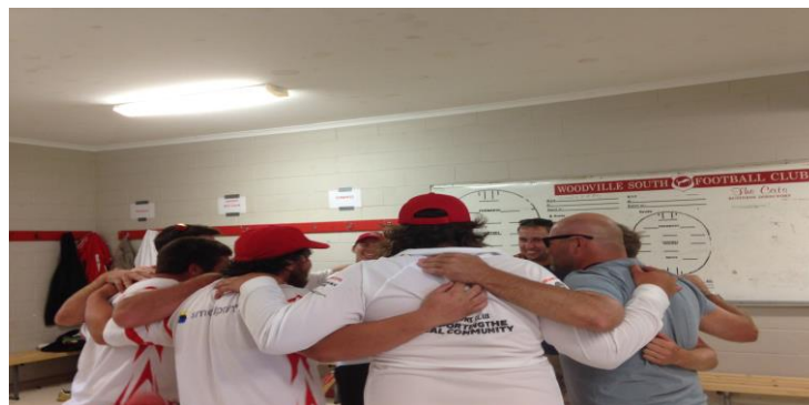
Sing Loud, Sing Proud